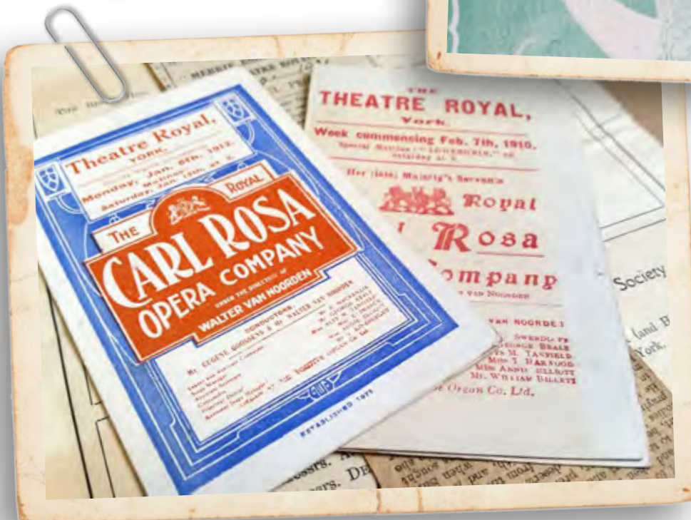
J W Knowles Collection KNO/8/2