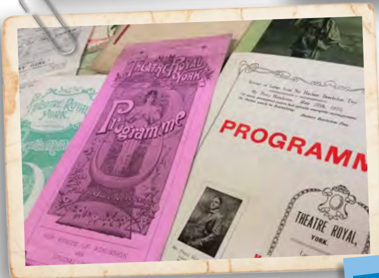
J W Knowles Collection KNO/8/2

In this pack you will find guidance notes for creative writing inspired by a York Theatre Royal programme from the early 1900s, and copies of the pages of the theatre programme.